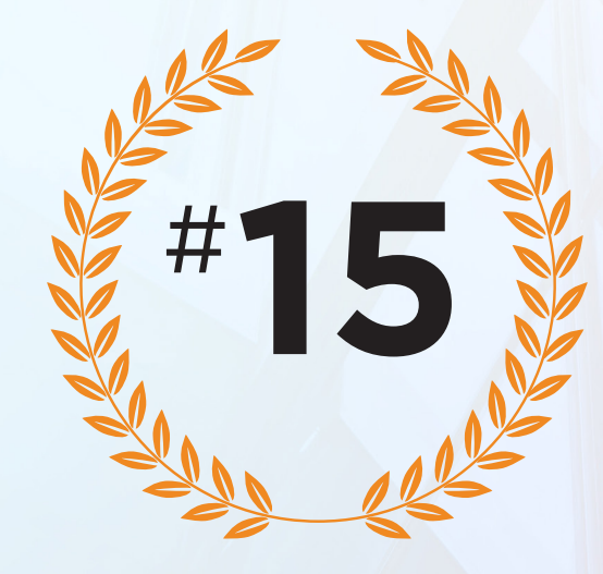
AmLaw 100 Profits Per Partner