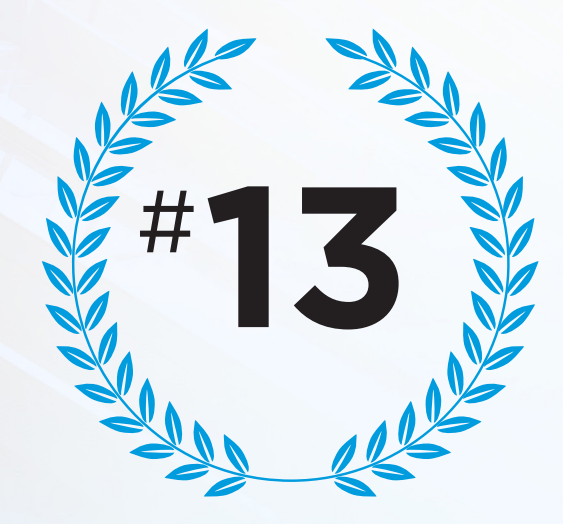
Vault Law 100 Prestige Ranking

For prestige, associate satisfaction, diversity, pro bono & profits