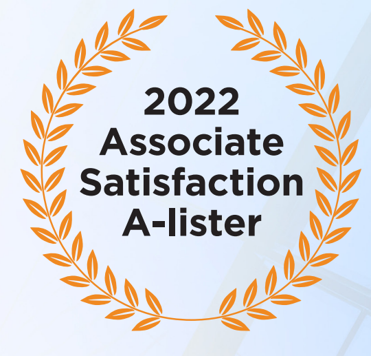
BTI Associate Satisfaction Survey