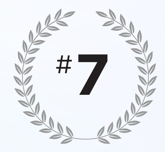
2023 Law360 Diversity Snapshot