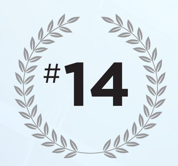
AmLaw 100 Revenue Per Lawyer