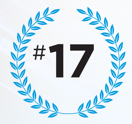
Vault Law 100 Prestige Ranking

For prestige, associate satisfaction, diversity, pro bono & profits