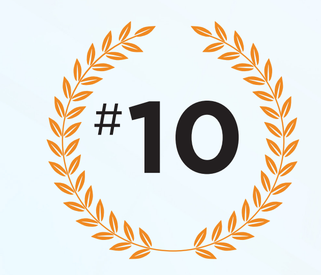
Breadth of Commitment to Pro Bono