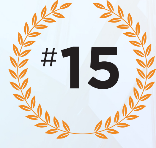
AmLaw 100 Profits Per Partner