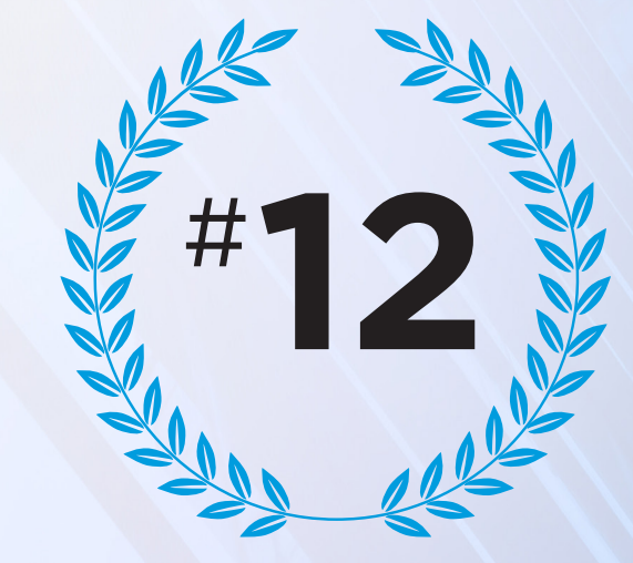
AmLaw 100 Compensation - All Partners