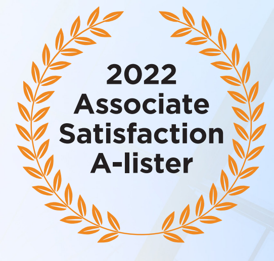
BTI Associate Satisfaction Survey