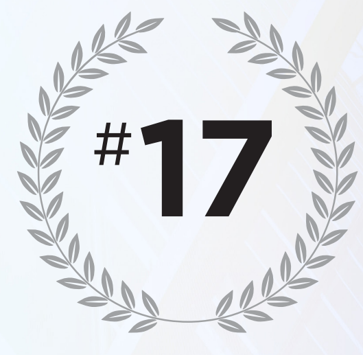
2023 Pro Bono AmLaw Ranking