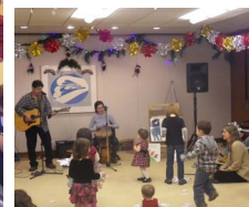
The Milbank Children's Holiday Party, hosted by the Women's Initiative and Associate Life Committees.

The mission of Milbank's Women's Initiative is to create a foundation that supports and promotes an environment rich with opportunities for our women lawyers to build strong careers and achieve their full potential.